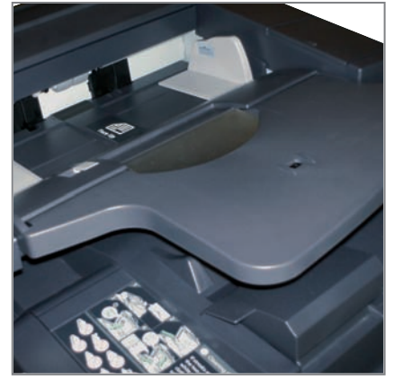
HIGH-SPEED DUPLEX SCANNING