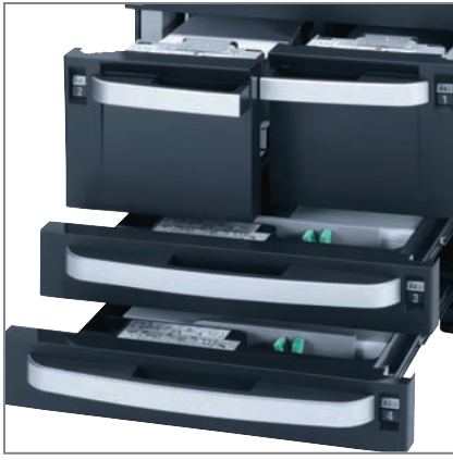
STANDARD PAPER CAPACITY up to 4,100 sheets