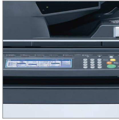
8" BROAD TOUCH-SCREEN with 640 x 240 dpi resolution